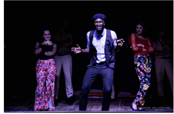
9-11 - For the 20th Anniversary of the Attack