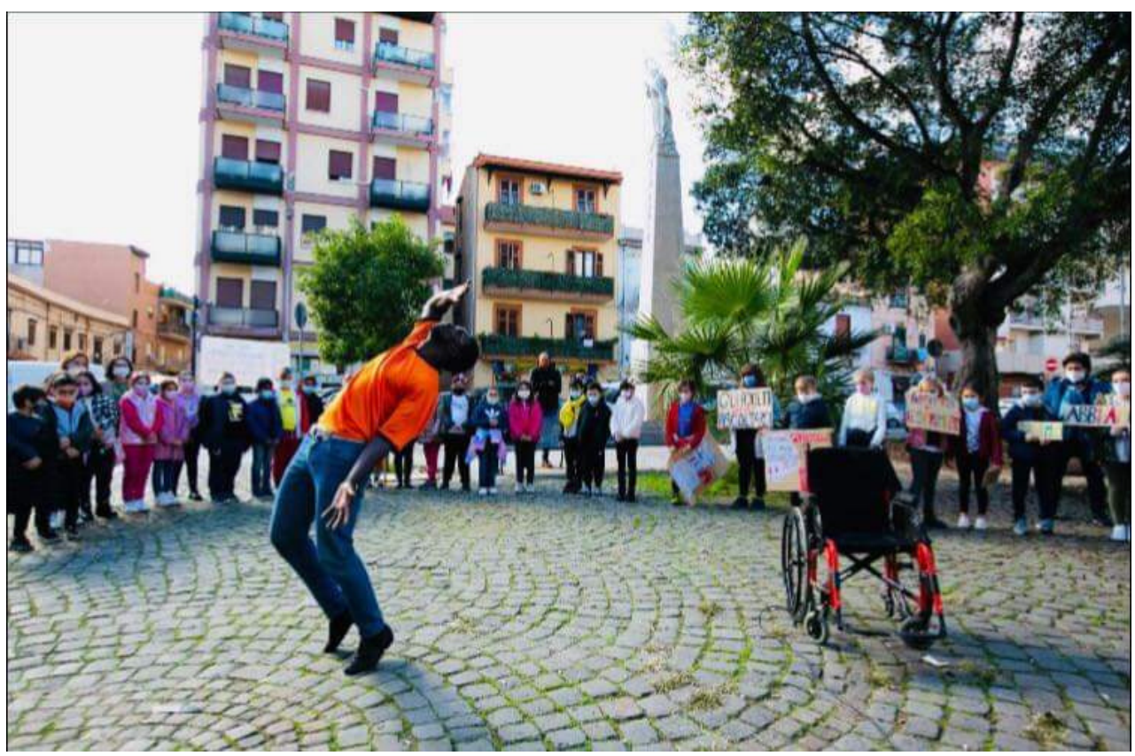
Atsu Just Dance - In a square in Palermo

Raizes Teatro is a Palermo-based cultural company that promotes human rights through the arts. Guest of the EU Parliament for the thirtieth anniversary of the UN Convention on the Rights of the Child; Raizes opened the FORUM on Democratic Citizenship organized by the Italian Government on the occasion of the Semester for the Presidency of the Committee of Ministers of the Council of Europe in Torino in 2022; it participated in the EU Fundamental Rights Forum 2021 in Vienna; Raizes is also organizer of Human Freedom, in collaboration with the Global Campus of Human Rights, a multidisciplinary program for the promotion of human rights through the arts; the company won the International Human Rights Art Festival of NY in 2020 and it also boasts collaborations with the University of Palermo; Columbia University; University of Roma Tre; Bar Association of Palermo; Avant-Garde Lawyers Paris.