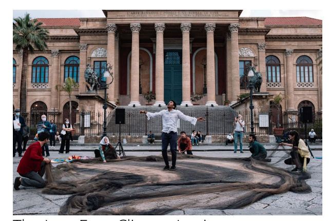
The Last Era - Climate Justice