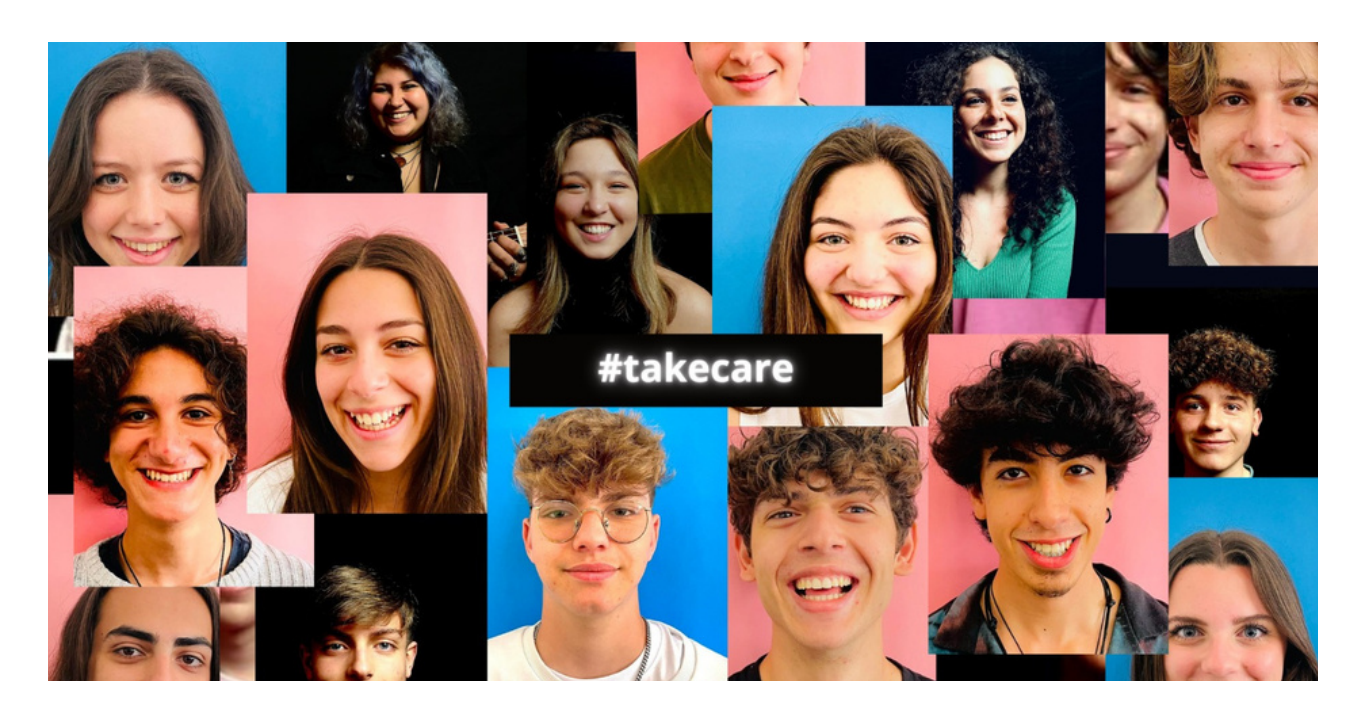
Raizes Campaign on Health and ChangeMaking with Students from Palermo City