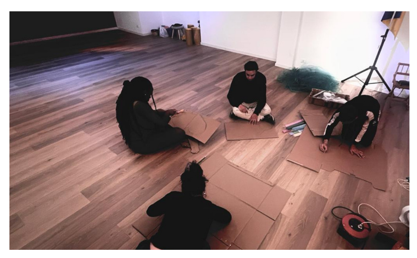
Raizes at Work