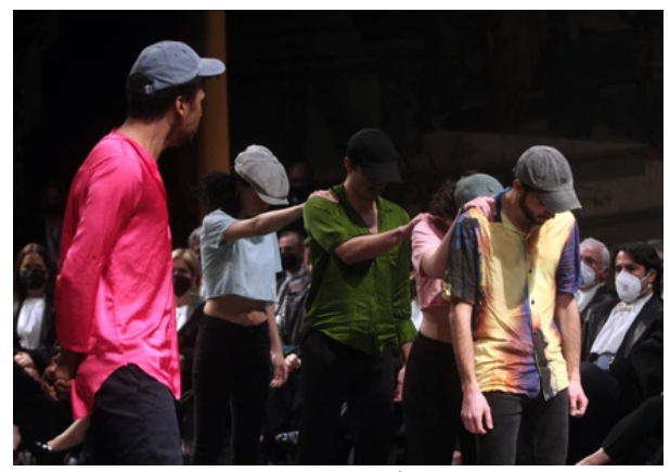
Free to Be - Paris December 2021 - Freedom of Expression